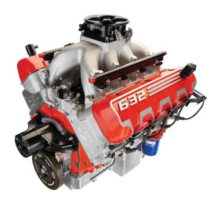
Mobil 1 is now The Official Motor Oil of Chevrolet Performance.