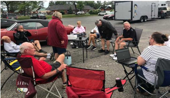
EMCC at the "Dragon"....