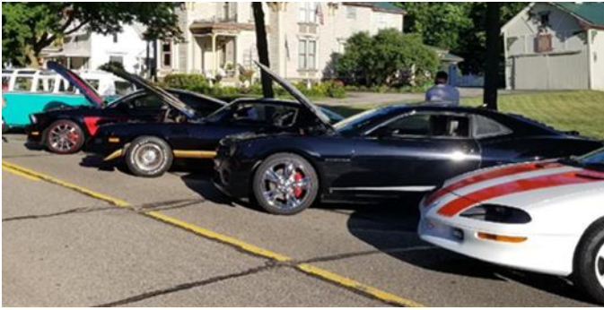
EMCC members at the St Ignace show

Here's pictures from the South Lyon cruise-in