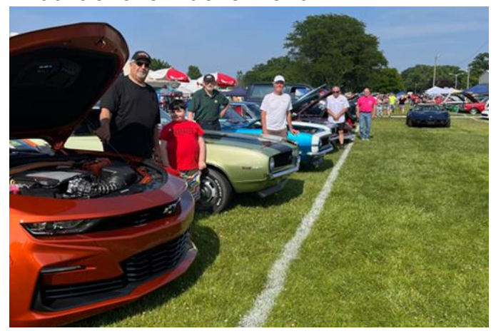
EMCC members at the June meeting