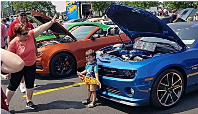
EMCC at the MiFbody Meet & Greet