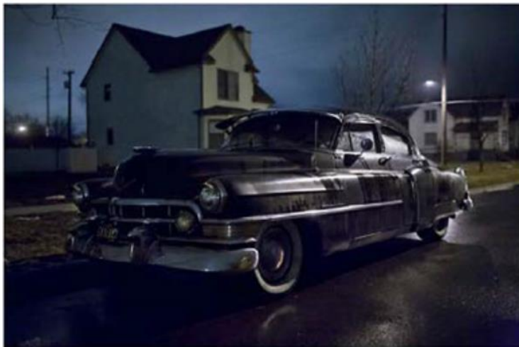
Black Caddie by Bruce Giffin

to benefit programs for veterans, promising artists and elderly patients and their caregivers