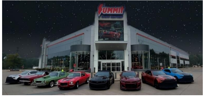
EMCC winning Club Participation!!