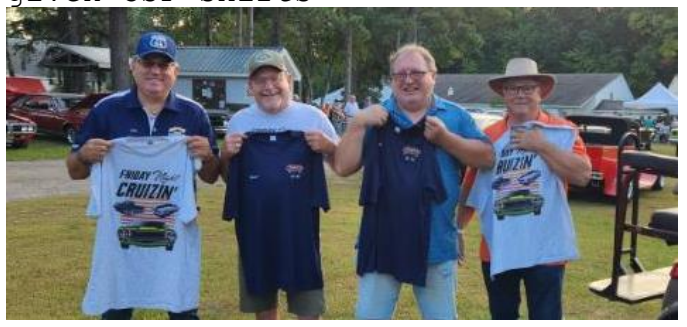
At Milan, the Vanguard folks and EMCC members in a group photo

At Multi-Lakes, sponsors were given CSF shirts